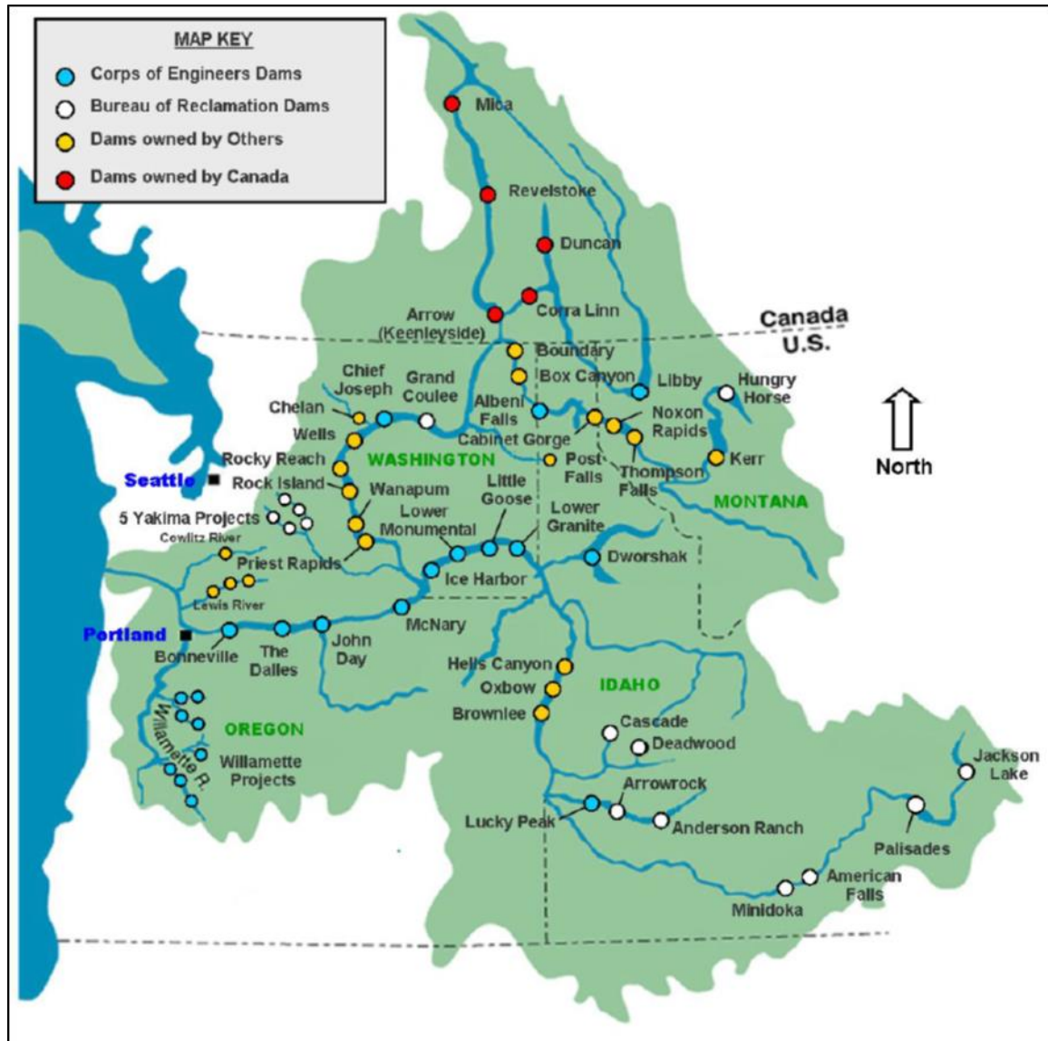
Figure 1. Columbia River Basin and Dams