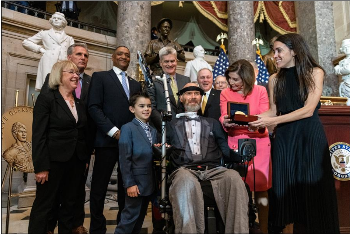
Figure 2. Congressional Gold Medal Presentation Ceremony for Stephen Gleason January 15, 2020

Source: U.S. Congress, House of Representatives, “Former NFL Player Steve Gleason Receives Congressional Gold Medal,” January 16, 2020, at https://www.house.gov/feature-stories/2020-1-16-former-nfl-player-steve-gleason-receives-congressional-gold-medal .