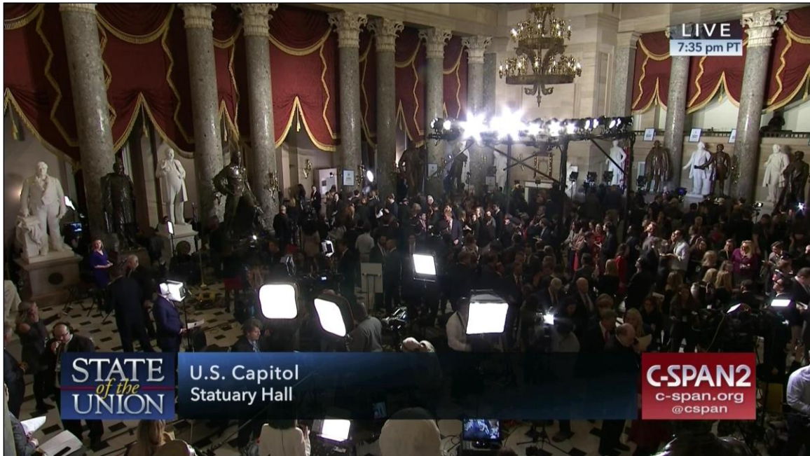
Figure 3. Media Interviews for State of the Union Address in National Statuary Hall January 30, 2018