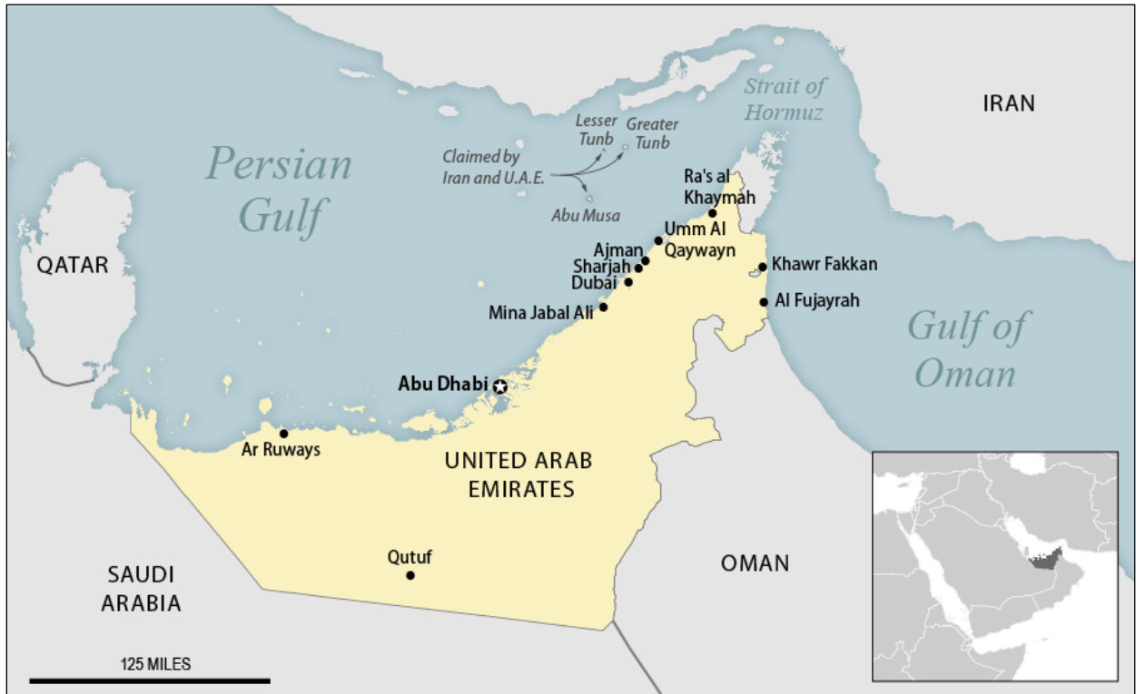
Figure 1. UAE at a Glance

The United Arab Emirates (UAE) is a federation of seven emirates (principalities): Abu Dhabi, the oil-rich federation capital; Dubai, a large commercial hub; and the five smaller and less wealthy emirates of Sharjah, Ajman, Fujayrah, Umm al Qaywayn, and Ra's al Khaymah. Since the late 1960s, the UAE's population has increased from 180,000 to over 9 million. Dubai, with a population of over 3 million, is the largest city and home to multiple expatriate communities from India, Pakistan, Bangladesh, the Philippines, Iran, Egypt, Nepal, Sri Lanka, China, and elsewhere (see Figure 1 ). Expatriates make up nearly 90% of the total UAE population.