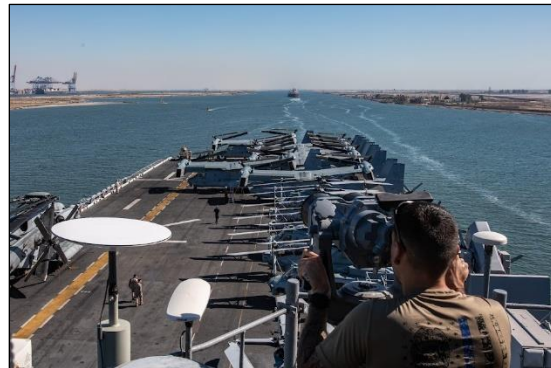
Figure 4. USS Bataan Transits the Suez Canal on its Way to the Gulf

In order to reassure Gulf partners that the United States remains committed to their defense and the free-flow of maritime commerce in the Strait of Hormuz, in summer 2023, the U.S. military deployed additional naval and air assets and manpower to the Gulf. In July and August 2023, the U.S. Navy deployed to the Gulf the amphibious assault ship USS Bataan (LHD 50) along with a dock landing ship (USS Carter Hall —LSD 50) and guided missile destroyer. Along with these naval assets, the U.S. military also deployed several teams of U.S. Marines to ride on commercial oil tankers transiting the Strait of Hormuz in order to deter Iranian interdiction. 146 Furthermore, the U.S. Air Force dispatched a squadron of U.S. Air Force F-35 Lightning IIs to the CENTCOM AOR; those fighters joined A-10 and F-16 fighter aircraft already in theater monitoring the Strait of Hormuz. 147 In total, U.S. CENTCOM estimates that more than 3,000 U.S. Sailors and Marines arrived in the Middle East in early August 2023. 148