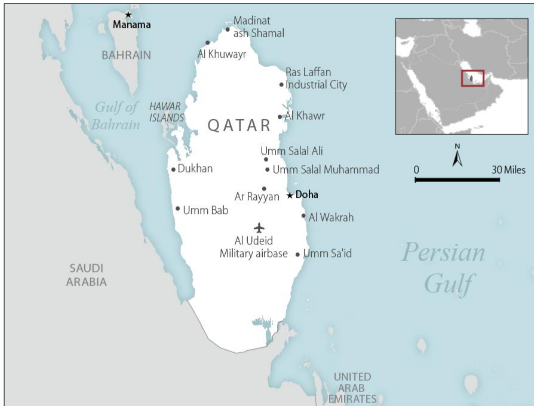
Figure I. Qatar at-a-Glance