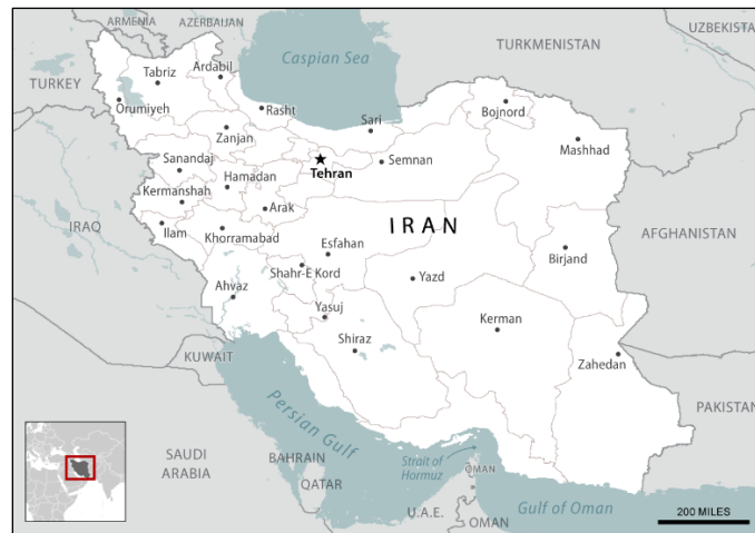
Figure I. Iran at a Glance

The Islamic Republic of Iran, the second-largest country in the Middle East by size (after Saudi Arabia) and population (after Egypt), has for decades played an assertive, and by many accounts destabilizing, role in the region and beyond. Iran's influence stems from its oil reserves (the world's fourth largest), its status as the world's most populous Shia Muslim country, and its active support for political and armed groups (including several U.S.-designated terrorist organizations) throughout the Middle East.