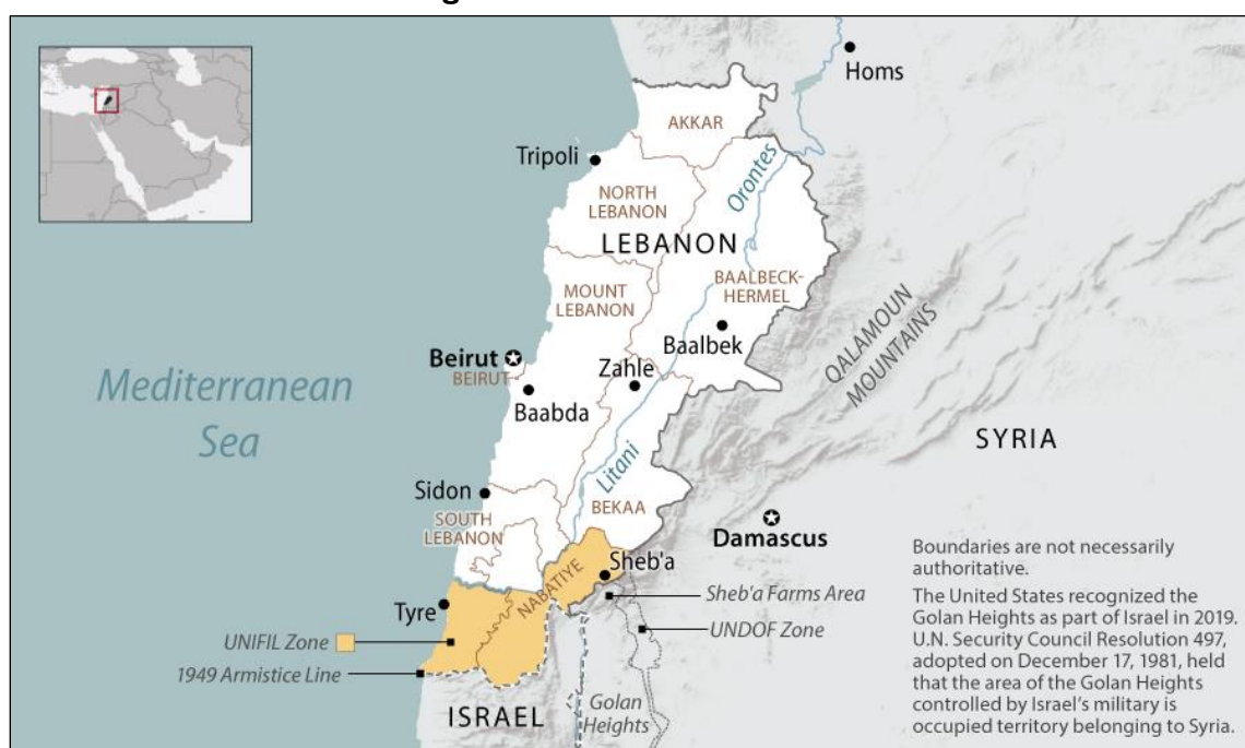
Figure 1. Lebanon at a Glance

Sources: Created by CRS using ESRI, Google Maps, and Good Shepherd Engineering and Computing.