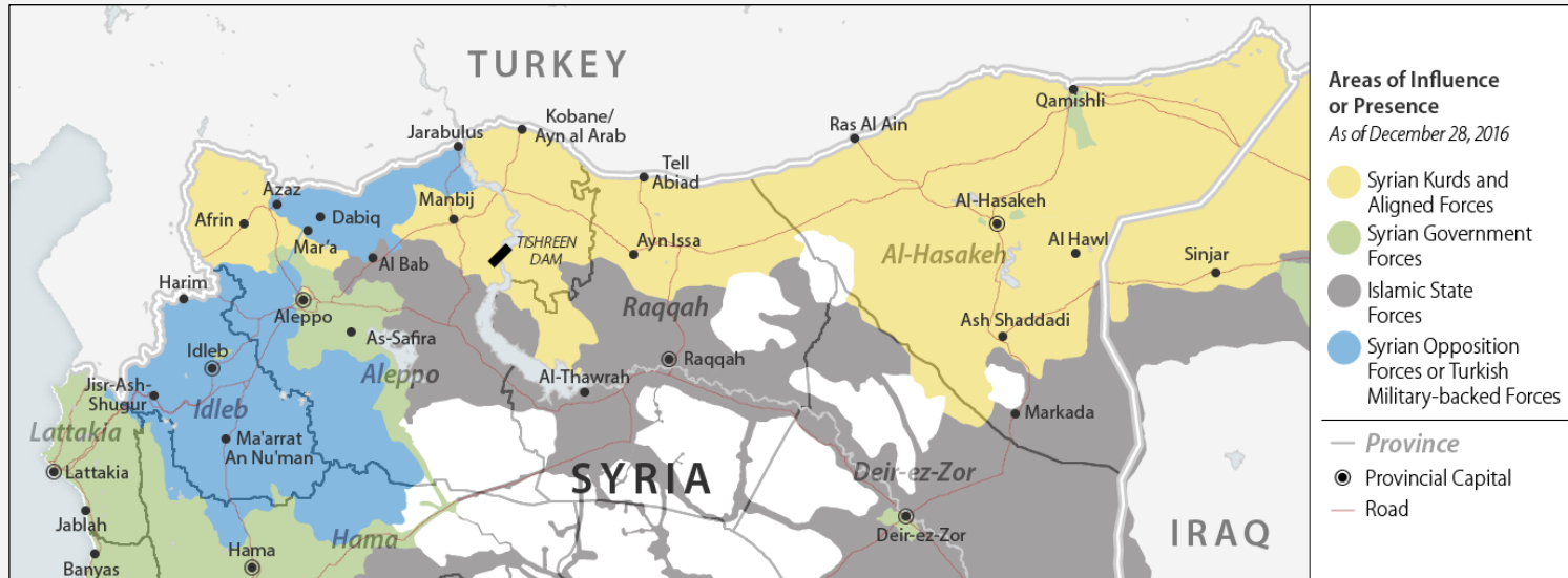
Figure 2. Syrian Kurds Countering the Islamic State: Map and Timeline

LATE 2013-EARLY 2014 As fighting between and among various Kurdish and Arab groups continues, the PYD/YPG establish a de facto ruling body for three northern Syrian cantons (Afrin, Kobane, Jazirah [the town of Qamishli and its surroundings]) with primacy over other Kurdish groups.