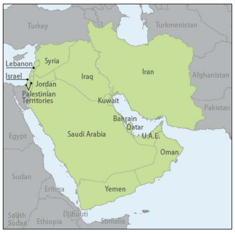
Figure 1. Countries in or Near the Arabian Peninsula for Which Travel Precautions Are Recommended