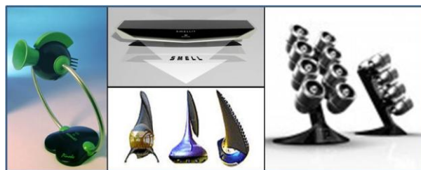
Figure 4. Examples of digital scent systems: Pinoke system (left), Smellit system by Nuno Teixeira (top), Smellit system by Olf-action (right), and iSmell system (bottom).

In addition to attempts to add smell to the projection of movies in cinema theaters, several smell-distributing systems were recently (2000–2005) developed to be used with home computers (e.g., iSmell by DigiScents, Pinoke by AromaJet, Smellit by Olf-action), and are currently being developed by companies like Scentcom ( www.scentcom.co.il ) and AnthroTronics ( www.anthrotronics.com ). These systems are frequently referred to as digital scent systems. Some of these systems are shown in figure 4.