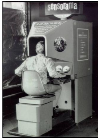
Figure 2. Sensorama: 4-D arcade game (1962).

participant rode a motorcycle through New York while different aromas characteristic of various places in New York were diffused around by surrounding fans (Rheingold, 1992).