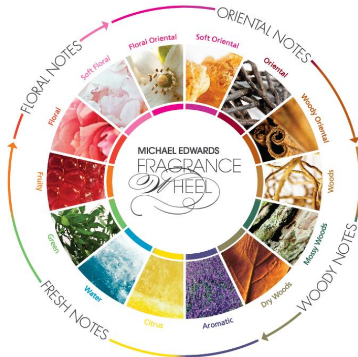
Figure 1. Michael Edwards' perfume fragrance wheel.

Odor classification schemes are often developed for specific applications. The odor wheel concept lays out a variety of odor classes in one ring and lists specific examples of each odor class in another ring. Odor wheels have been constructed for a variety of odor classification applications, such as for wine, coffee, compost, and wastewater (Burlingame et al. 2004, Rosenfeld et al., 2007, Hammond 2010). Probably the most famous odor wheel is The Wine Aroma Wheel developed for California wines by Ann Noble in 1984 (Noble et al., 1984). The wheel has been modified later by many people and in many ways to be used with other kinds of wines (e.g., in Germany for German wines) but is considered by some experts too limited for current wines (Duman, 2011). Other odor wheels include a beer wheel (Meilgaard et al., 1982), whiskey wheel (Piggot and Jardine, 1979), cider and perry wheel (Williams, 1975), brandy wheel (Jolly and Hattingh, 2001), perfume fragrances wheel (Edwards, 2012, figure 1), compost wheel (Suffer and Rosenfeld, 2007), and fruit juice wheel (Muir et al., 1998).